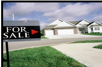
COMING SOON CALL FOR DETAILS