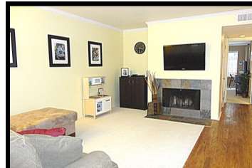
24510 PARK AVE JUST SOLD—$390,000