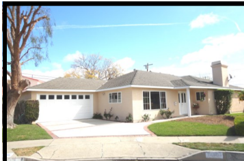
PENDING—$800,000 24804 GLENCOE WAY